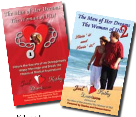
Volume 1: The Man of Her Dreams The Woman of His!

These are the two books that are bringing MIRACLES to Marriages everywhere they are read!